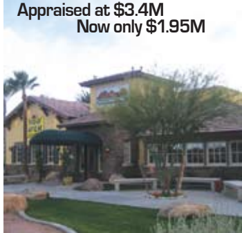
Appraised at $3.4M Now only $1.95M